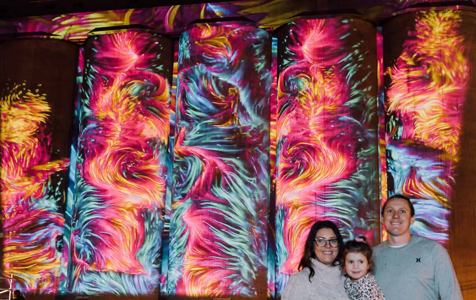
Former BEST OF THE BEST winners, Karoonda Silo Art in SA by HEESCO and Illuminart (above) and Thallon's 'The Watering Hole' in Outback Queensland by The Zookeeper and DRAPL (below).